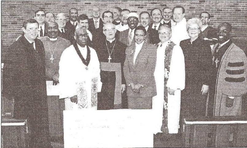
Religious leaders and representatives of MARCC gathered behind the statement of dedication.